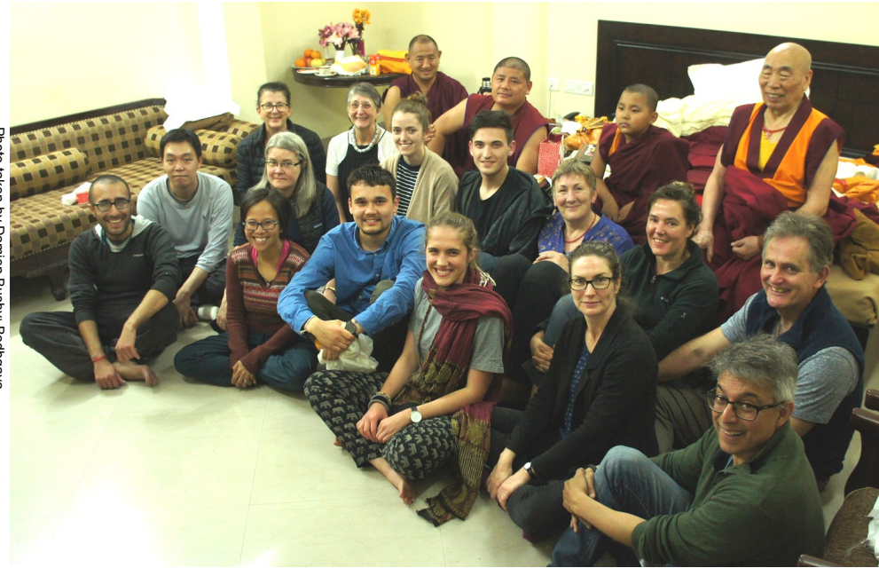
Bodhgaya

On day one, no mucking around, His Holiness dived straight into teachings on emptiness and how to approach the Kalachakra initiation. "The purpose of receiving the Kalachakra initiation is to make transformation within oneself." But we can't blindly just follow and hope the good vibes of the initiation will do (oops, I better get my act together). He said prayers and faith alone won't lead to transformation of the mind; instead we need to integrate the teachings to train our mind.